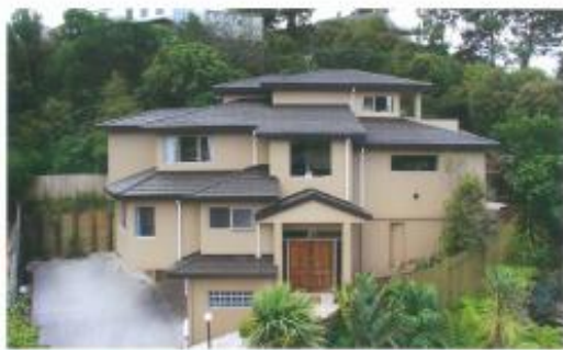
MURRAYS BAY 25A Penguin Drive

Meticulous, Marvelous, Memorable..... This spacious and comfortable home provides the perfect space for families and young professionals alike. Situated at the end of a long & offers both security and privacy. Its elevated site sits on an enviable location with fantastic proximity to the beaches and local amenities. A perfect opportunity to enjoy and sample the calm lifestyle of the East Coast Bays. With Murrays Bay Intermediate and Rangitoto College nearby it is located in the perfect school zones for the kids. There are four ample bedrooms which includes a spacious master suite. The wonderful open plan living area provides the perfect room for entertaining and relaxing. There is also a double garage and ample space outside to park a boat!